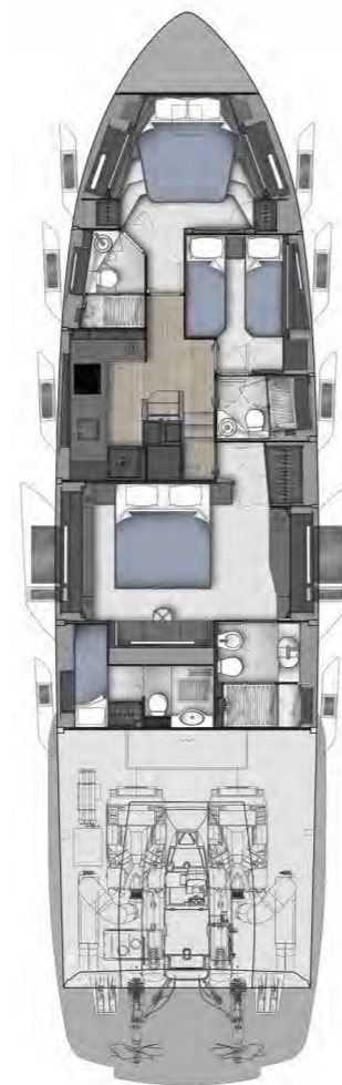
Lower Deck | 3 cabins std layout