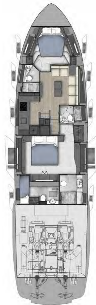
Lower Deck | 2 cabins with lower dinette layout (opt)