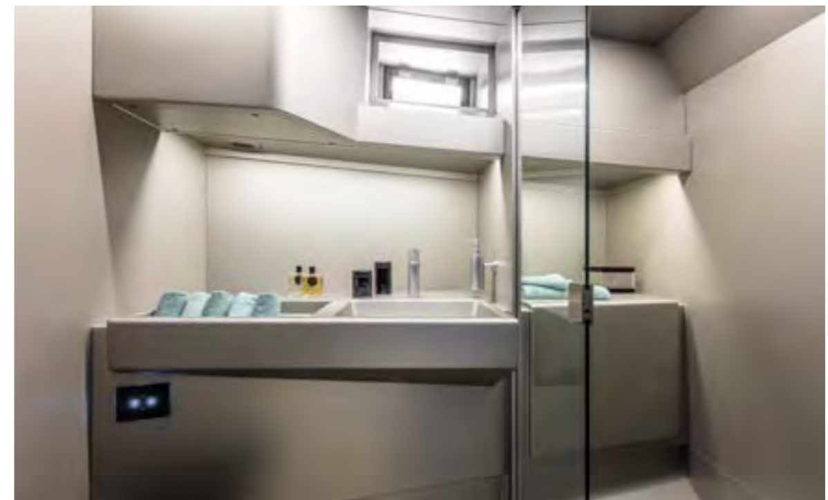
Air-conditioned cabin Generous bathroom with separate shower