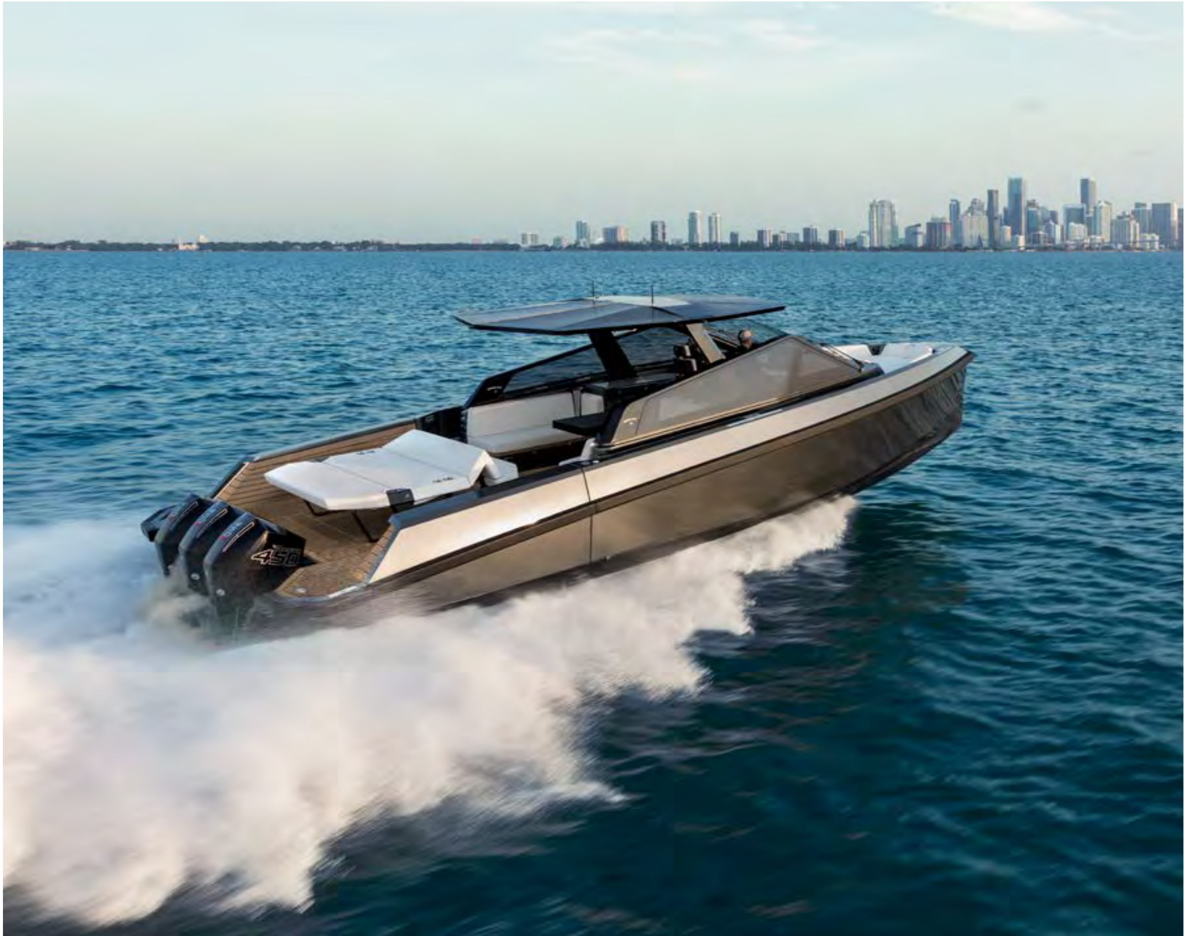
Wally shows its sportive side with wallytender43X