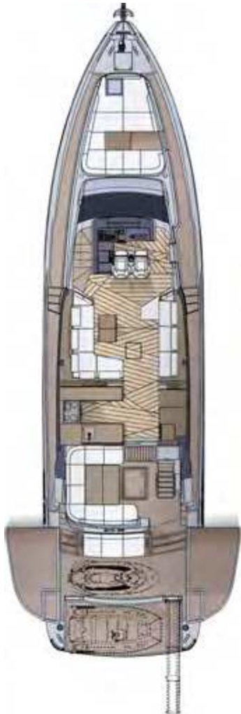
OPT Main Deck

LOA = LENGTH OVER ALL ISO 8666 MAXIMUM BEAM DEPTH UNDER PROPELLERS (BOAT FULLY LADEN)