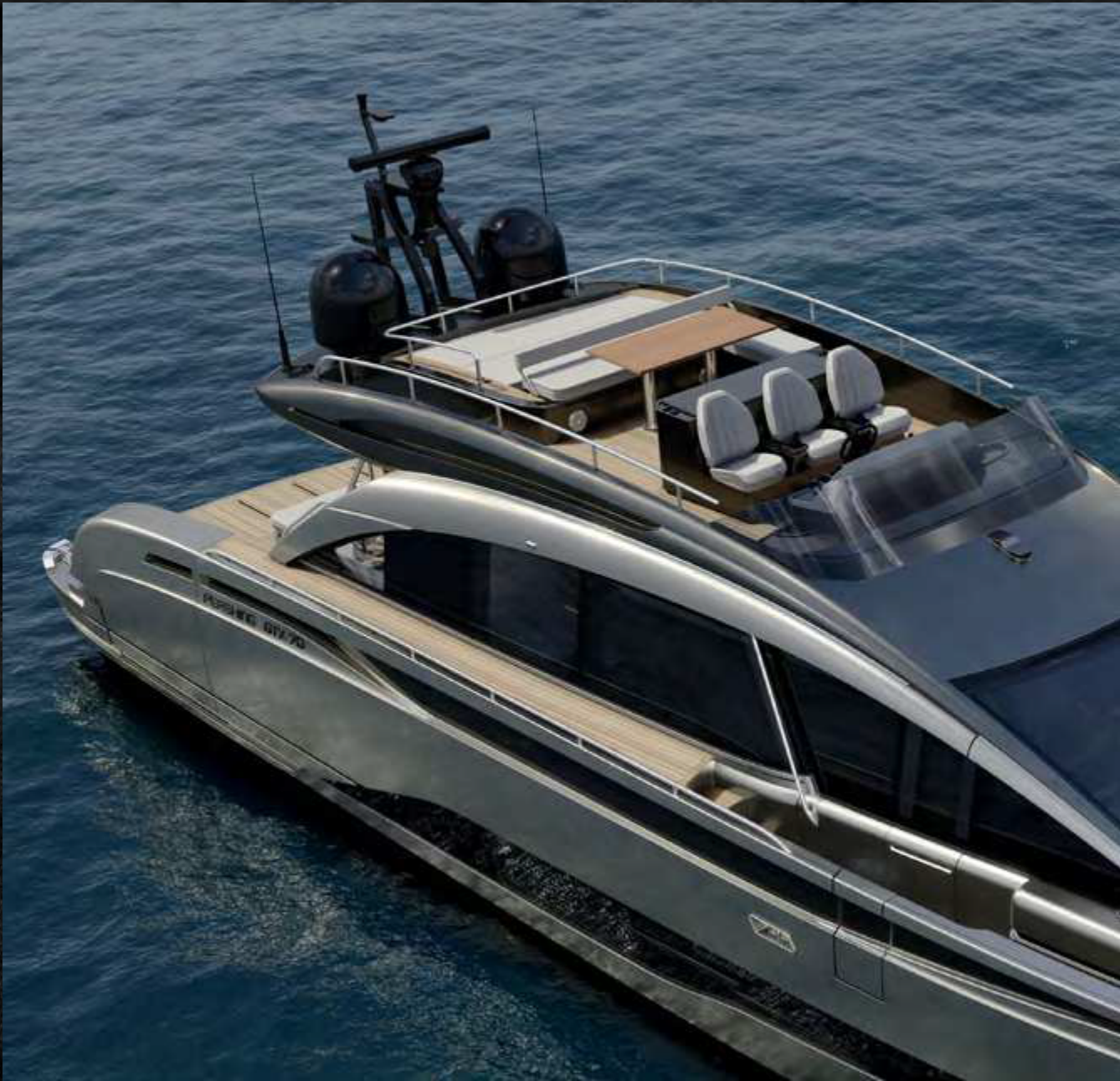
Pershing GTX70 Propulsion

Compact, sporty, and resolute, the Pershing GTX70 features triple IPS engines and an advanced control system. Designed for refined comfort and effortless maneuverability, it provides a driving experience that balances elegance with ease.